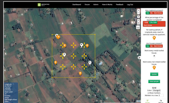
Classify land usage, human settlements, woody cover, and other landscape features from multiple satellite imagery feeds.

By pooling millions of submissions from the crowd, large-scale surveys can be completed in days rather than years, enabling on-time reporting, rapid field interventions, and automation through machine learning.